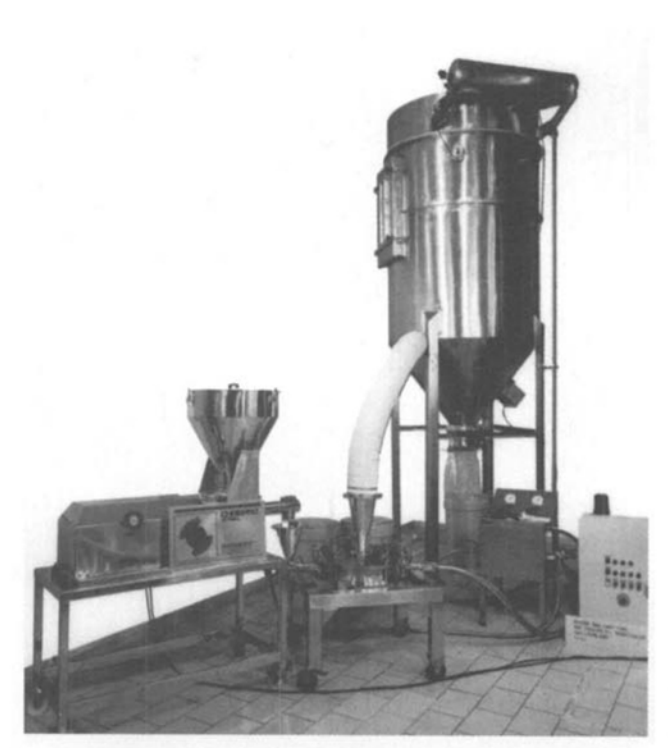
Figure. CHRISPRO JET-MILL MC 500

Micro-Macinazione SA employs 20 people, has a capital share of CHF 1000000.– and operates in a factory of its own property. From beginning 1995 Micro-Macinazione SA will start the micronization of \beta -lactame products in a new production building, separated from the existing factory and fully dedicated to this processing. The Customers of Micro-Macinazione SA are the most reputed Swiss and European Pharmaceuticals Companies.