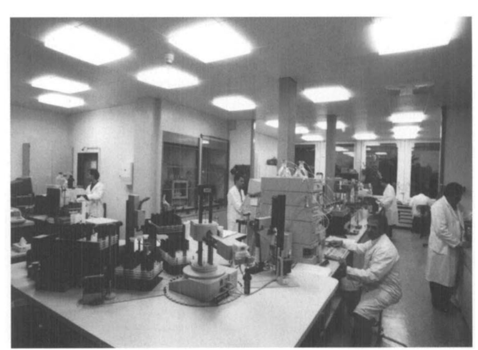
Figure. Automation in the control lab for finished products with a robot in the foreground