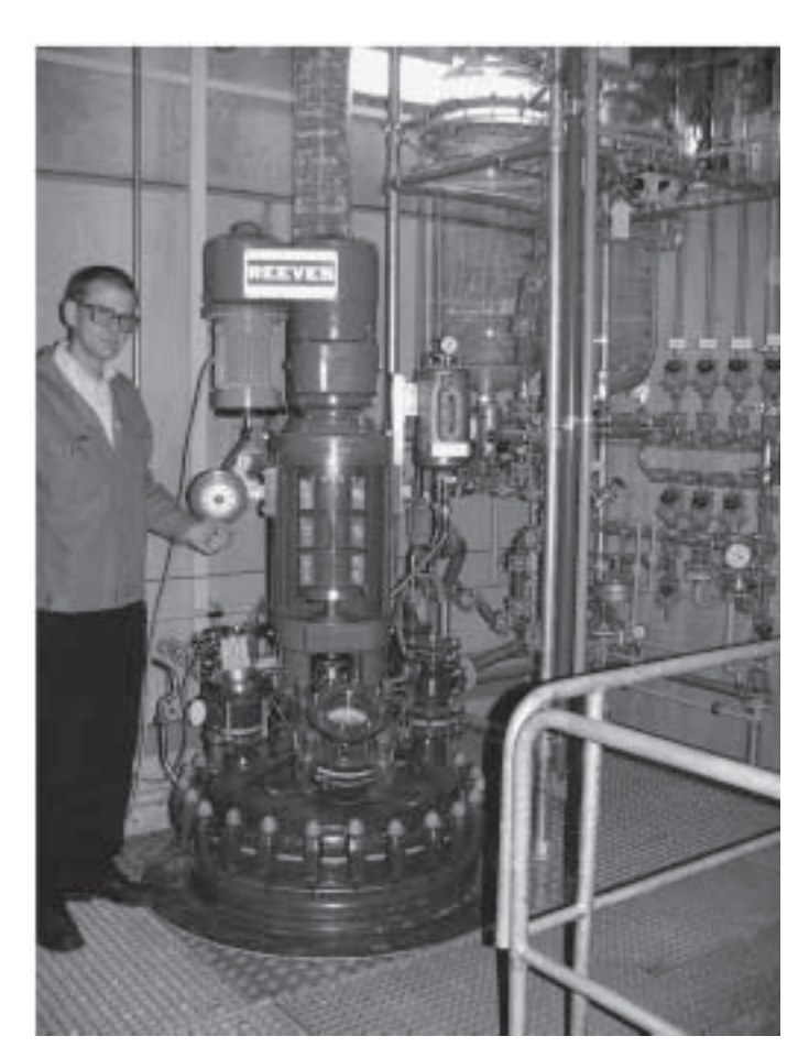
Fig. 1. The new 400 I glass-lined multipurpose reactor with heating/ cooling system (-20 to +150 °C)