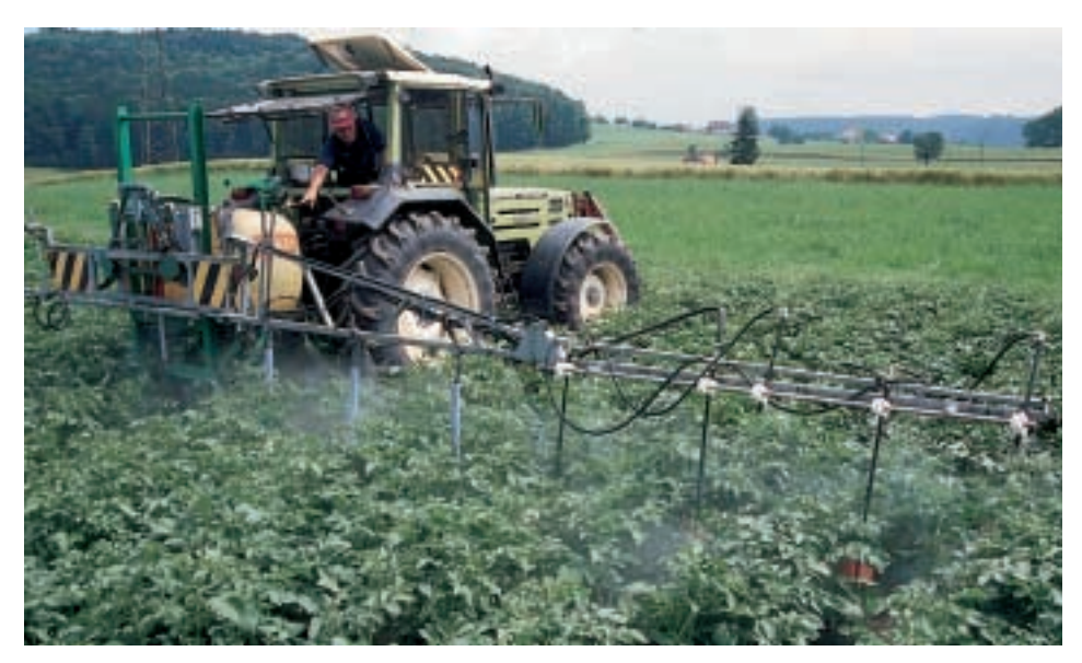
Fig. 1. An underleaf spraying system enabling the spray to be applied from above and below (system Fischer)

of coverage. Only the underleaf spraying system ensured a coverage of up to 37% on the lower leaf side (Fig. 2).