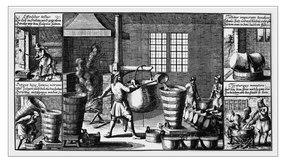
Fig. 2. Different steps during the recovery of potassium nitrate (saltpetre)

not too high, because it was an additional job they had to do. Therefore the quality of the black powder varied widely [2].