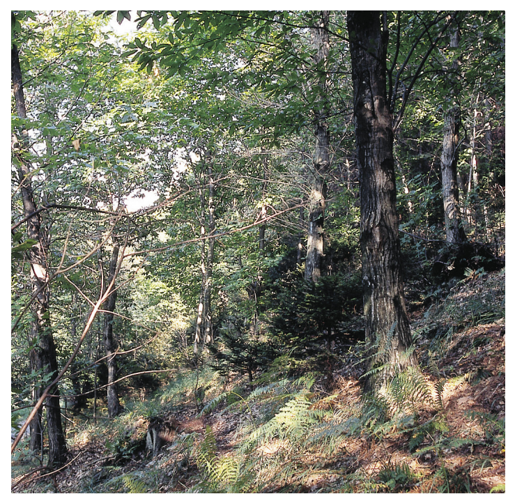
Chestnut forest stand at Copera

The soil water chemistry in a chestnut forest at Copera near Monte Ceneri in Ticino has been monitored since 1987 to measure the soil response to atmospheric acid deposition. This area, with its mainly acidic bedrock, is very sensitive because the soil is poorly buffered. It has received high loads of acidifying compounds due to local and long-range emissions from the industrial Po Valley in Italy. Acid deposition declined through the 1980s and 1990s, mainly because of the reduction of SO<sub>2</sub> emissions following air pollution abatements. This raised the question whether the forest soil has recov-