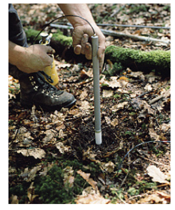
Installation of a lysimeter