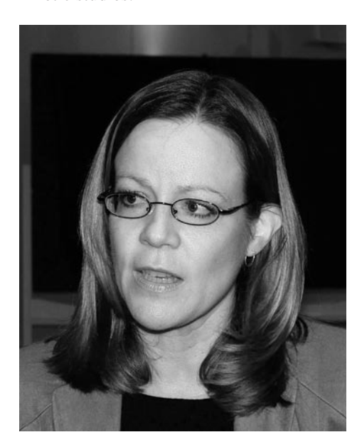
Donna G. Blackmond

The evening lecture was given by Donna G. Blackmond (Imperial College, London). Prof. Blackmond provided a convincing case for the use of reaction calorimetry for the determination of kinetic parameters. In this technique, heat flow is directly proportional to reaction rate. In a remarkable re-evaluation of a number of asymmetric transformations reported to display non-linear effects, the crucial role of the physical behaviour of the reactants and catalysts was shown. The audience was left in no doubt as to the importance of this work in future kinetic studies.