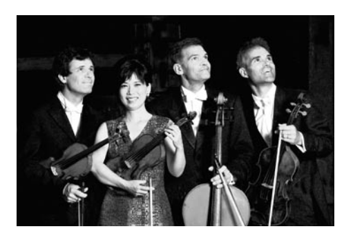
Aura String Quartet

After a relaxing afternoon and a conference dinner at the Bürgenstock club, an evening concert of chamber music by Schubert, Shostakovich and Dvorák was performed by the Aura String Quartet , in a programme chosen by the President himself.