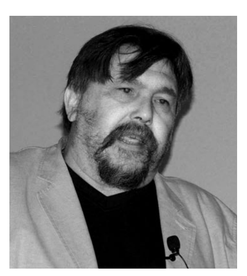
Hermann E. Gaub

muscle, and SMFM was used to mimic this effect in vitro . Another creative application of SMFM involved the sequential unfolding of bacteriorhodopsin, which showed the unfolding energy barriers of this membrane-bound protein. This method was also applied in a scale-like system where binding energies of annealed DNA strands were determined by comparison with a reference, and finally in the use of azobenzene's two photoinducible conformations to produce motor energy.