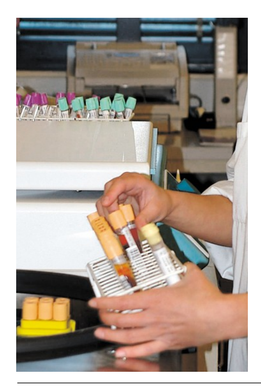
Blood samples being transferred to the centrifuge