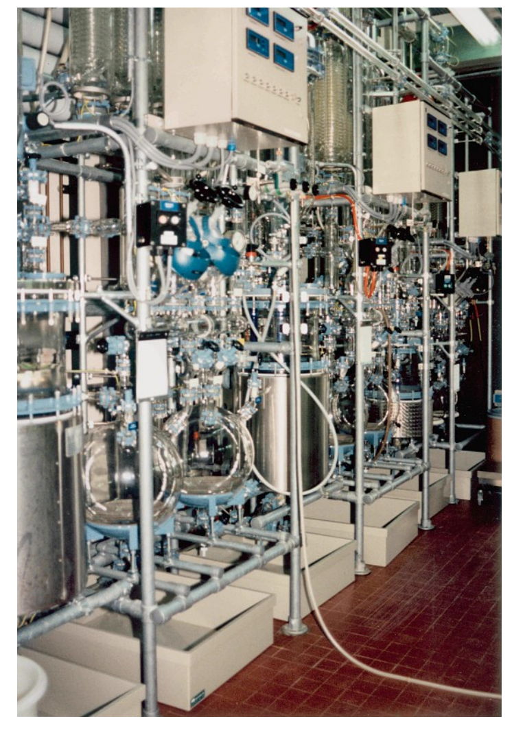
Set of 100 liter and 50 liter vessels

One year later, the company employed four additional chemists, was certified according to ISO 9001, executed the first contracts under full current good manufacturing principles (cGMP), and gave the first