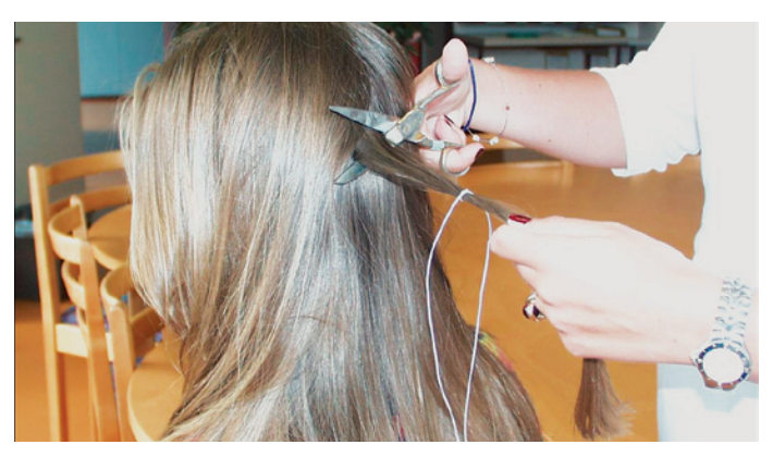
Hair sampling: the first important step in hair testing