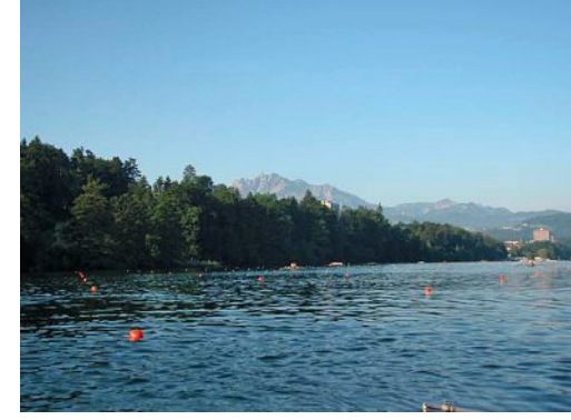
The Rotsee near Lucerne, prepared for a rowing regatta.

water may contain small or larger concentrations of methane. (Artwork: Eliane Scharmin)