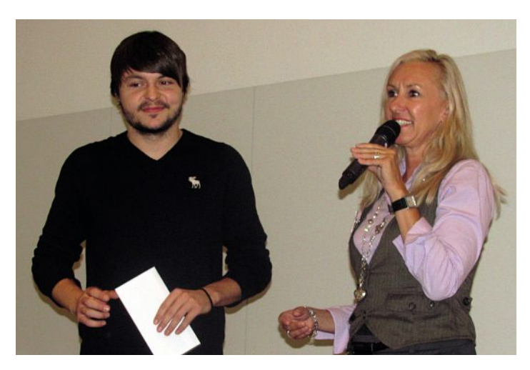
The student who won the College Day Award in 2011.