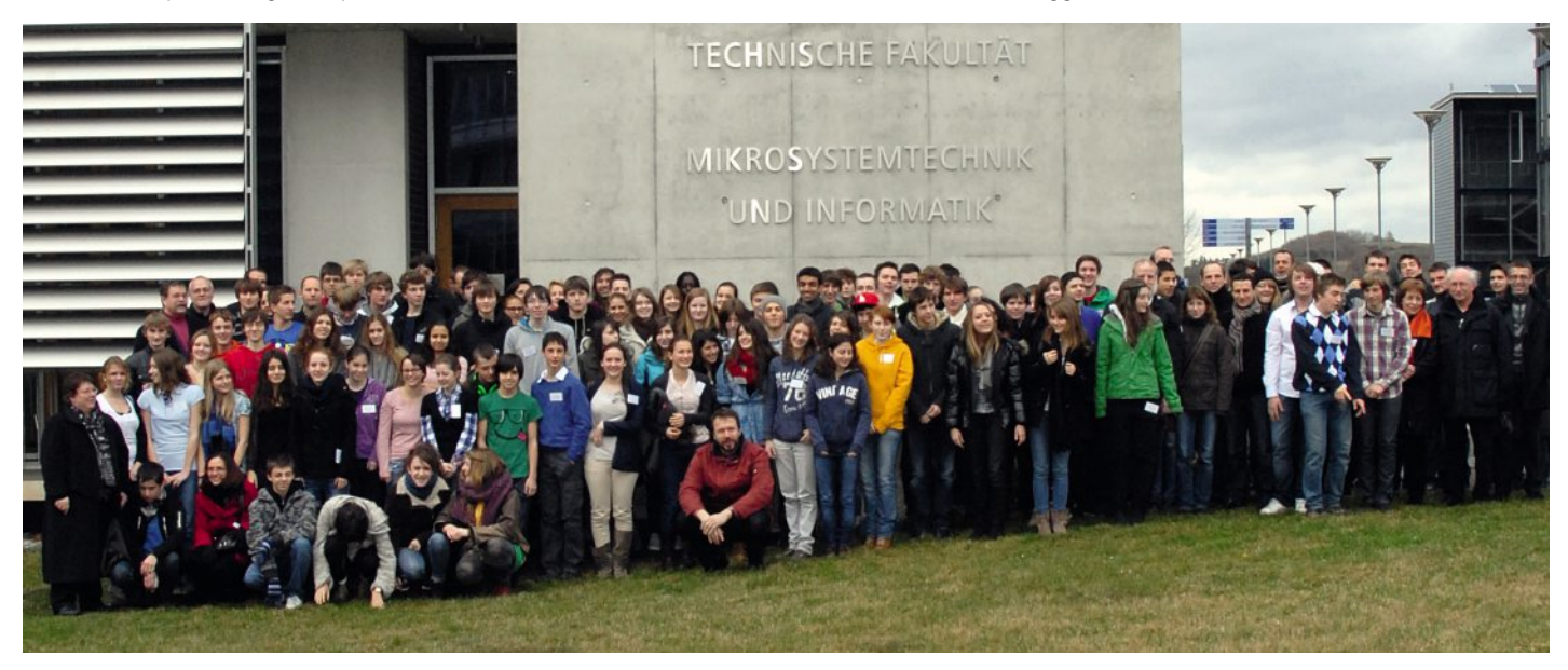
Students at University of Freiburg im Breisgau DE.