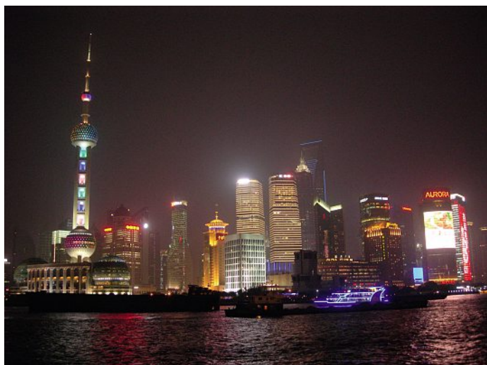
The Chinese government has an aggressive policy of promoting biotechnology, particularly in Beijing and Shanghai (pictured). Large amounts are being invested in genome research and China is the world leader in bioethanol.

supplies start-up companies with promising products with the required infrastructure and the laboratory environment they need for their activities completely free of charge for a year. At the other end of the scale, the Swiss visitors watched a large number of young people – mainly women – at a testing facility roughly comparable to Empa performing a variety of quality control tasks, such as checking, weighing and cutting goods to size, in narrow cubicles measuring just 50 × 50 cm. Most of them did not leave the workplace to eat their lunch and also had a short sleep there. It was not possible to find out what level of education these people had, but it is evidently fairly difficult to keep well-trained people on board.