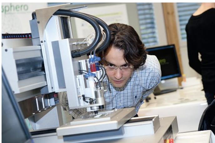
Annual meeting TEDD2012 Wädenswil. A visitor at the TEDD annual meeting examines the 3D Discovery from regenHU. This bioprinter prints three-dimensional tissue consisting of living cells, a scaffold made of hydrogel-like biomaterials and signalling factors. Human skin models are being printed in the ongoing TEDD network project.

and his team are experimenting with human placental tissue into which they are inserting fluorescing polystyrene nanoparticles with a diameter of 50 nm to half a micrometre. They do not harm the tissue and are easy to identify. Measurements have shown that the tissue can hold back particles measuring 200–300 nm but that smaller particles pass directly into the circulation of the fetus.