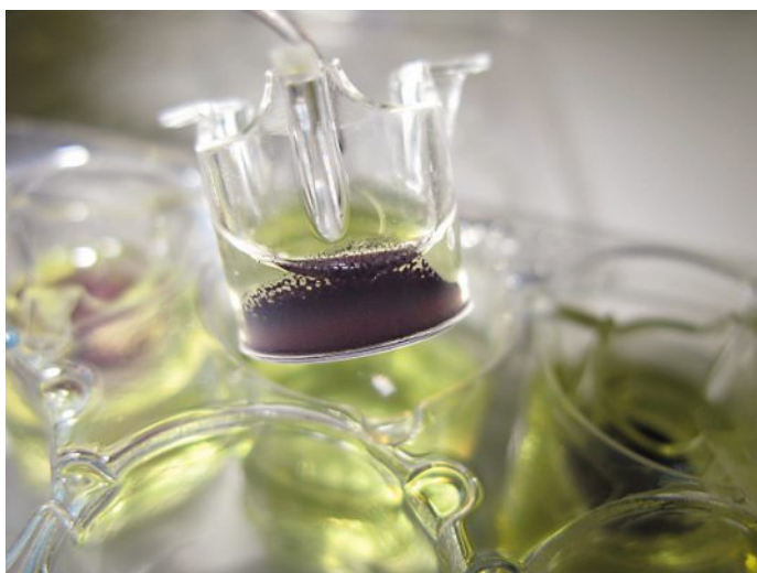
Annual meeting TEDD2012 Wädenswil. Human 3D tissue model for drug development and substance testing.

Scientists at ZHAW have collaborated with InSphero, specialists in the growth of cell assemblies in ‘hanging drops’, to implement a deep-freezing process which enables 3D tumour microtissues to be supplied in a cryopreserved state at –80 degrees Celsius. This allows consumers to remove the quantity of tissue they need from the freezer without the functionality of