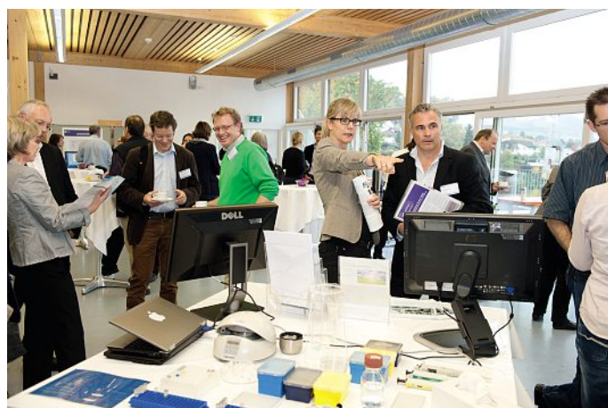
Annual meeting TEDD2012 Wädenswil. The automation stand attracted a lot of attention because routine handling of tissue models in drug development is only possible with automated systems. The companies Tecan and Cellendes and researchers from ZHAW presented the results of their work on the automated manufacture of scaffold-based tumour tissue and its applications.

This applies particularly to the centre of excellence in tissue engineering and drug development. TEDD, which emerged from the biotechnet platform in early 2011, develops tissue models similar to organs which are used to develop drugs and test active substances, the longer-term aim being to replace conventional in vitro tests with cells combined with animal studies. Technologies which provide a physiologically relevant representation of the function and structure of healthy and diseased tissues and organs are gaining importance all the time. New analytical processes and controlled, standardized production of tissues and ways of preserving them, high-throughput (HTP) applications and quality control methods will all have to be developed before these technologies can go into routine use. Efforts are focused on 3D cell and tissue models, assay development, cryopreservation, imaging technologies, automation and molecular reporting systems.