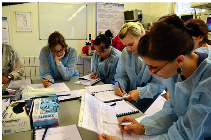
ZHAW Wädenswil Summer School. Summer school students in the laboratory. The practical work included recording and discussing the results generated by experiments.