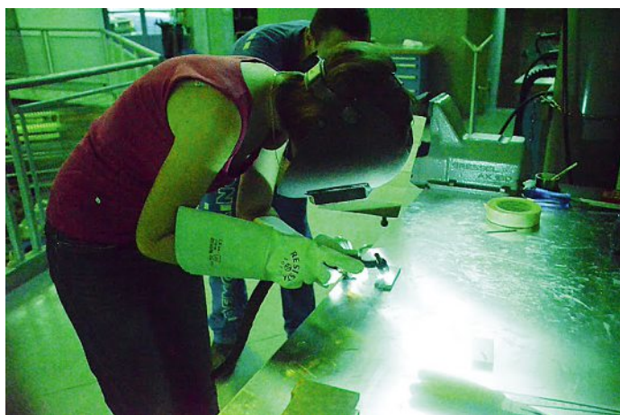
ZHAW Wädenswil Summer School. A visit to Bioengineering AG demonstrates the demanding design and manufacturing requirements that apply to steel bioreactors for cell culture. The visitors had a chance to show off their welding skills.