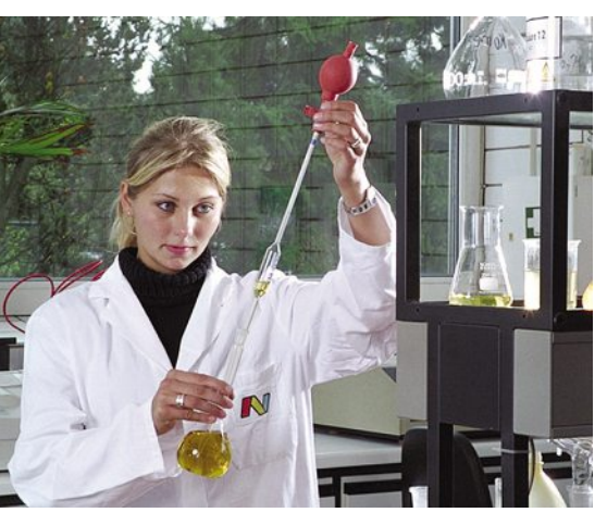
Working in the lab: Mismatch between industry requirements and taught courses.

Two thirds of chemical companies currently have difficulty in filling vacancies. Some shortages arise from a mismatch between the requirements of industry and taught courses, e.g. academia focuses on synthetic chemistry but 40 percent of EU chemical production involves formulation chemistry.