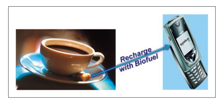
Fig. 2. Energizing the cellphone with a cube of sugar to run an embedded biofuel cell.

Energy research at the Life Technologies Institute in Sion is focused on waste conversion into fuels by biocatalysis and energy efficiency in bioprocessing. The often interdisciplinary research is facilitated through collaborative work with the nearby Systems Engineering Institute, whose activity covers hydropower, photovoltaic, wind energy, smart grids and energy efficiency. Energy research at the institute began with investigations on electricity production from microbial fuel cells. They are thought to be useful to power hand-held electronic devices (Fig. 2), or implanted pace makers and for large-scale applications such as power generation during waste-water treatment. Their application is investigated for industrially relevant microbes such as Yeast, Escherichia coli and mixed consortia as used in wastewater treatment. A method to assess the productivity of given bioelectrical systems in a step-by-step manner is available for the design of new bioelectrical system variants and optimization.