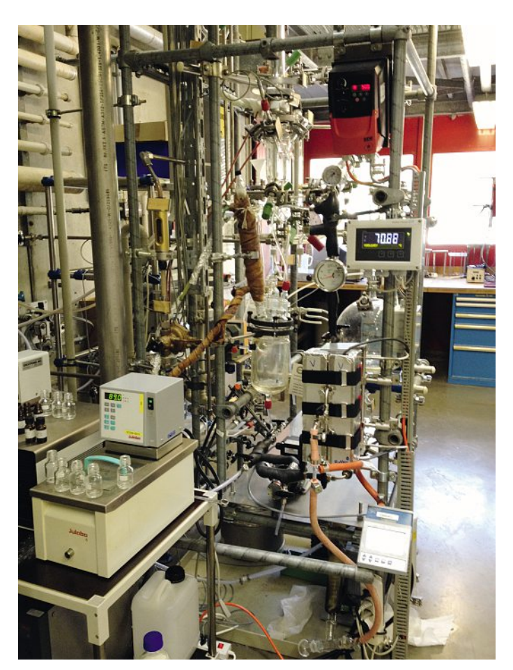
Fig. 1. Hybrid process (rectification and pervaporation unit).

Due to the expected longer lifetime and better thermal stability, ceramic membranes were tested with priority and compared to polymer membranes. In many test runs with different parameters like temperature and flow rate, the membranes were characterized regarding their water flux and solvent purity obtained, measured