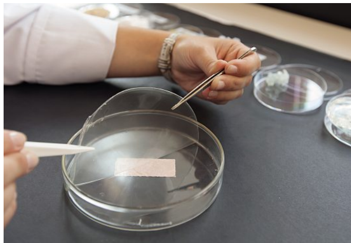
A novel generation of bacterial biopolyesters are more transparent and exhibit enhanced material properties.