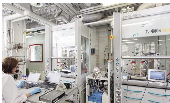
Safety first! The recently established fermentation infrastructure enables the safe handling of bioprocesses with dangerous gases (CO, CO 2 and H 2 ).

“Our idea is to replace traditional carbon substrates – sugars and fatty acids – with cheap, non-food competitive alternatives from Valais”, explains the scientist. He and his colleagues at the Institute of Life Technologies at HES-SO Valais investigate therefore pomace – the residue obtained after pressing and distillation – of native fruits such as apricots, cherries, and grapes. In the case of wine waste especially, promising results were achieved for producing PHA by bacterial fermentation. “PHA is interesting for producing PHA by bacterial fermentation”, comments Manfred Zinn. “Its material properties can be adjusted to produce different products such as adhesives (glue), elastomers (hydrophobic coatings) and thermoplasts (solid products).”