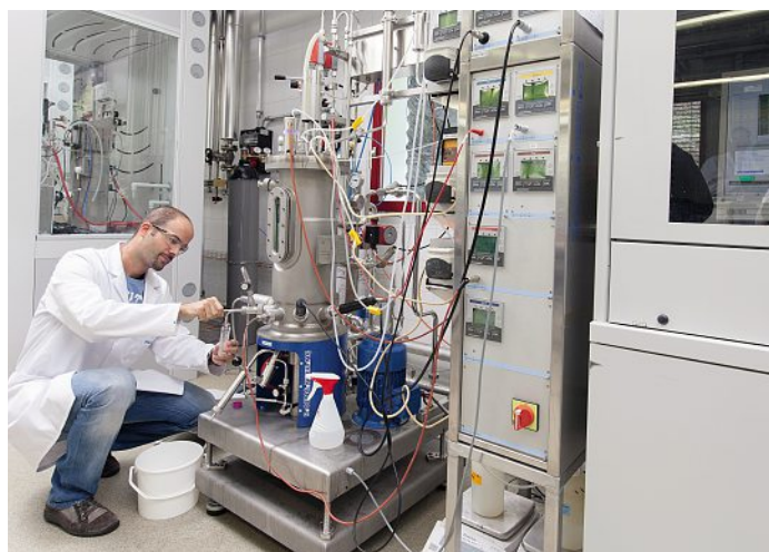
Fed-batch cultivation of Pseudomonas putida for the production of polyhydroxyalkanoates.

The idea of developing plastics synthesized by bacteria is receiving growing attention due to rising oil prices and plastic