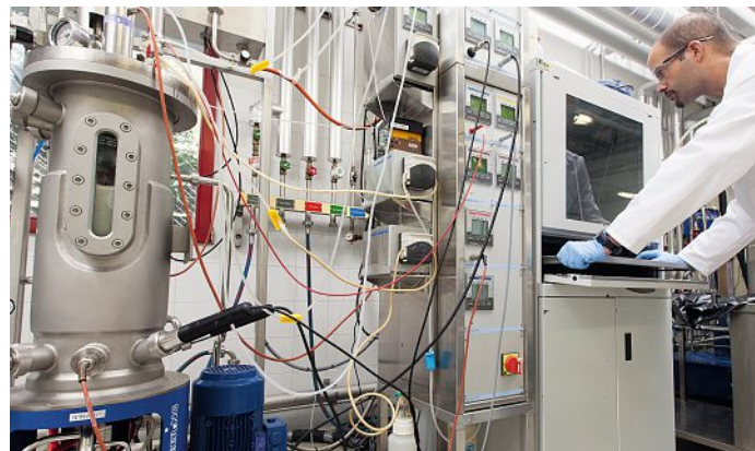
Modern process analytical technology is essential for the biosynthesis of novel generation polyhydroxyalkanoates.