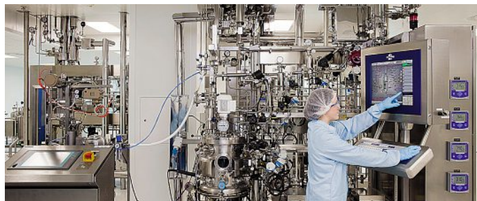
Fill-finish of therapeutic protein-based drug substances at the Irish National Institute for Bioprocessing Research & Training (NIBRT).