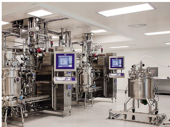
Upstream processing suite at the National Institute for Bioprocessing Research & Training (NIBRT) in Dublin, showing two completely controlled 150-litre perfusion bioreactors (left of image) and harvest vessel (on right of image).

limited to any one area – they are essentially micro-reactors with controlled properties.”