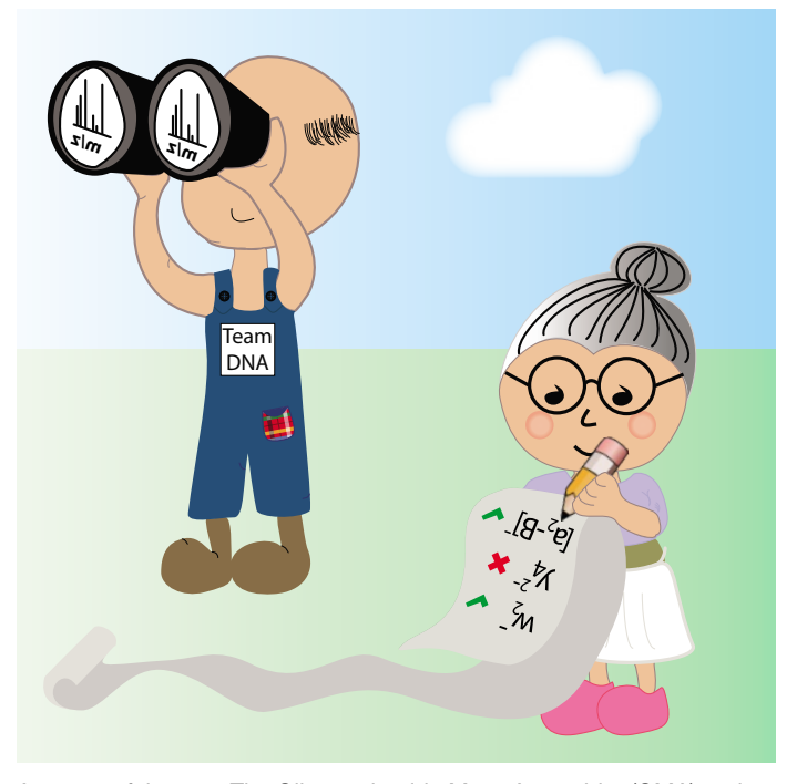
A successful team: The Oligonucleotide Mass Assembler (OMA) and the Oligonucleotide Peak Analyzer (OPA) calculate and match the fragment ions of nucleic acids, respectively.

Oligonucleotides comprising unnatural building blocks, which interfere with the translation machinery, have gained increased attention for the treatment of gene-related diseases ( e.g. antisense, RNAi). Due to structural modifications, synthetic oligonucleotides exhibit increased biostability and bioavailability upon administration. Consequently, classical enzyme-based sequencing methods are not applicable to their sequence elucidation and verification. Tandem mass spectrometry is the method of choice for performing such tasks, since gas-phase dissociation is not restricted to natural nucleic acids. However, tandem mass spectrometric analysis can generate product ion spectra of tremendous complexity, as the number of possible fragments grows rapidly with increasing sequence length. The fact that structural modifications affect the dissociation