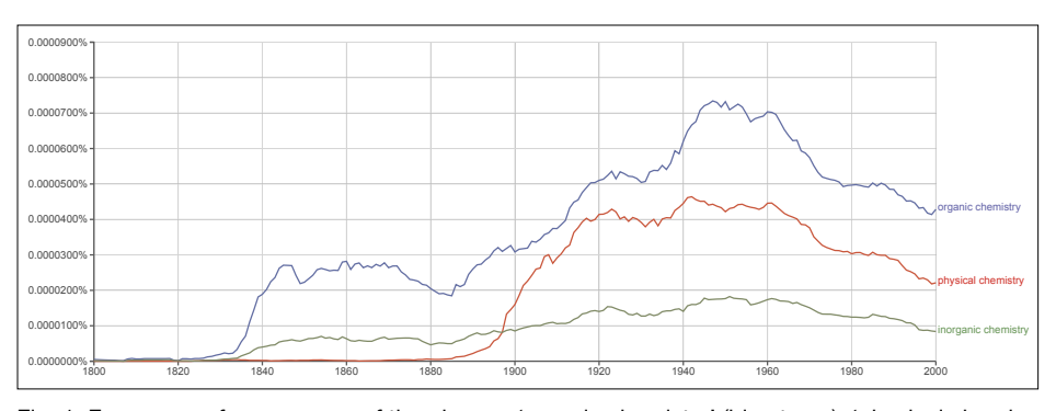
Fig. 1. Frequency of appearance of the phrases 'organic chemistry' (blue trace), 'physical chemistry' (red trace) and 'inorganic chemistry' (green trace) in books in English, 1800–2000. Generated using Google Books Ngram Viewer, http://books.google.com/ngrams .

"Those of us who were familiar with the state of inorganic chemistry in universities twenty to thirty years ago will recall that at that time it was widely regarded as a dull and uninteresting part of the undergraduate course....The factors primarily responsible for the modern forward-looking spirit in inorganic chemistry are two external developments, which give it, first, a new sense of purpose, and, second, new tools with which to achieve this purpose..."<sup>[5]</sup>