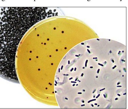
Onion seeds, agar plate with colonies of Salmon ella sp. isolated thereof and single Salmonella cells under the microscope (from left to right).

Focused-Ultrasound (HIFU) subsequent and nano-LC separation of resulting peptides. The latter are subsequently identified by MALDI-TOF/TOF mass spectrometry. The of use peptides as biomarkers extends the usable mass range and type of