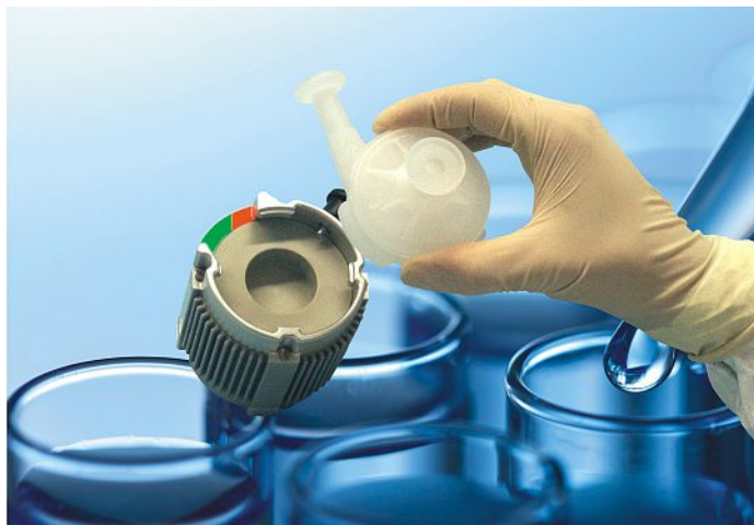
PuraLev® 200SU: single-use pump system for gentle conveyance of sensitive media. 1200 l/h flow volume free of noise and pulsation with an 11×11 cm footprint.

various pump types on protein quality. They measured enzyme activity and particle size to document changes in the proteins.