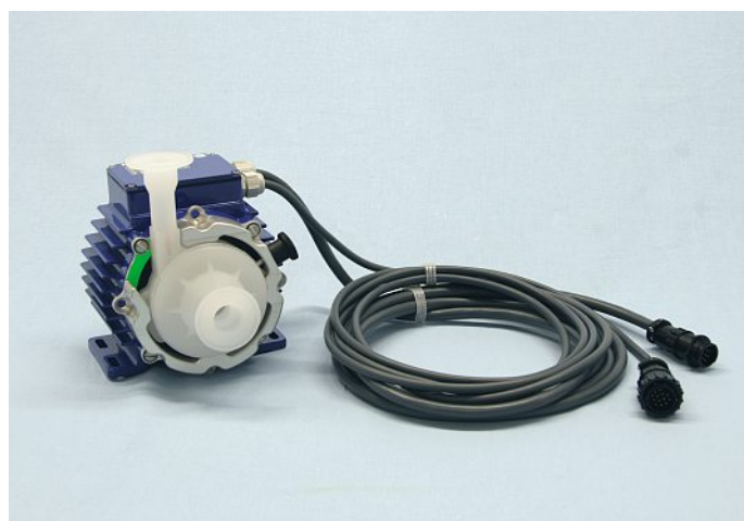
PuraLev 600SU: single-use pump system with a constant pumping capacity of 4500 l/h and a footprint of 15×17 cm.