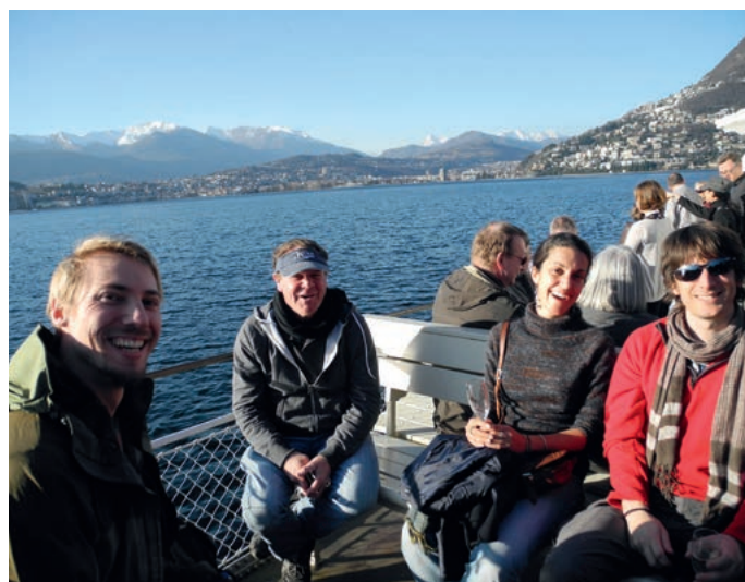
ContaSed 2015 participants on Lake Lugano.

downhill hike to the lake shore village Gandria and a boat cruise on Lake Lugano.