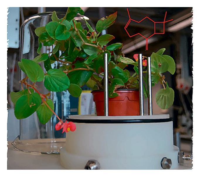
Begonia semperflorens within the container used to study its chemical emissions. During daylight it produces caryophyllene, among hundreds of other molecules.

The traditional way to do so is to sample the air surrounding the plant and analyzing the gaseous compounds by gas chromatography-mass spectrometry (GC-MS). GC-MS has been the workhorse for decades to decipher plants' volatile communications. However, the fact that GC-MS requires sample collection and further manipulation limits the opportunities to capture the