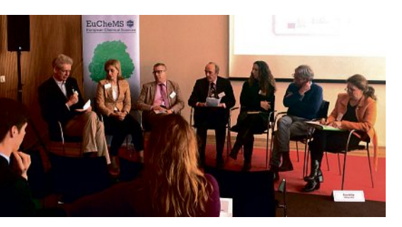
The workshop "Science: How close to open?" took place in Amsterdam on 5 April.

On the occasion of the Open Science Conference organised by the Dutch presidency of the Council of the EU, EuCheMS organised the workshop "Science: How close to open?" which took place in Amsterdam on 5 April.