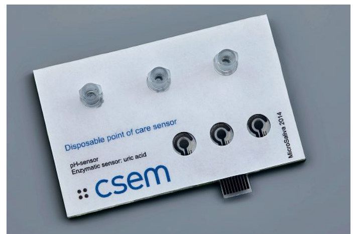
Disposable point-of-care sensor for non-invasive diagnostics.