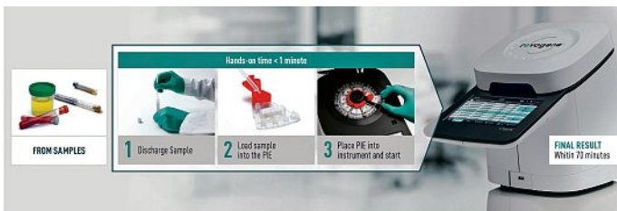
GenePoc Workflow Revogene: From samples to final results within 70 minutes.

patrice.allibert@genepoc.ca www.genepoc-diagnostics.com