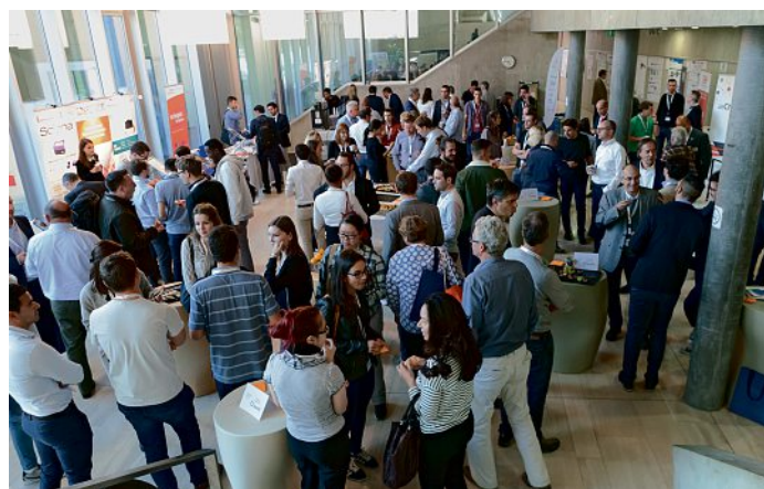
Participants at the Symposium exchange views and experiences on issues of topical interest in POCD.