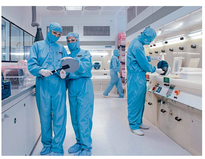
Fig. 1. Chip manufacturing requires high purity chemicals. Production and analytics is performed in a 'clean room'. The above picture shows a BASF test lab for cleaning chemicals used for silicon wafers.

It was planned to directly introduce the product into the multipurpose production unit WS-2049 in Schweizerhalle. This production unit is part of the so-called launch platform in Schweizerhalle. The launch platform consists of process development labs, kilo lab, pilot facilities, multipurpose production and process analytics all on one site. This concept allows the fast transfer of specialty products from process development to production (Fig. 3). The launch platform is especially suited for electronic