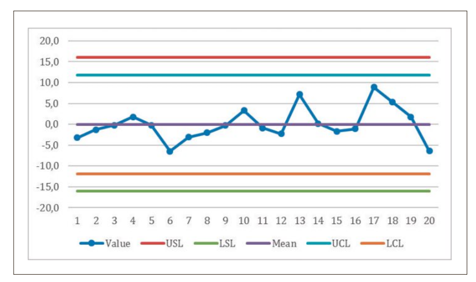
Fig. 2. SPC Chart of a capable production process with Cpk = 1.35.