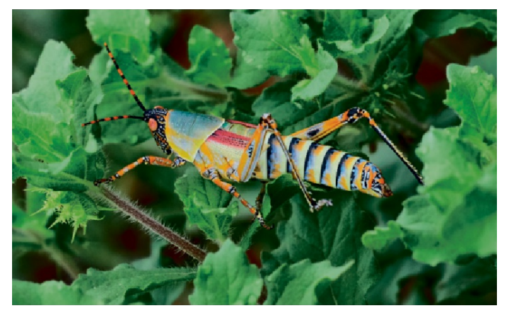
Fig. 1. The elegant grasshopper ( Zonocerus elegans ).

Elegant grasshoppers ( Zonocerus elegans ) are widespread in South Africa and easily recognized by their bright colours and bold markings (Fig. 1). Juvenile elegant grasshoppers are also strikingly marked (Fig. 2). The related variegated grasshopper ( Z. variegatus ) occurs in western and equatorial Africa and is also brightly coloured. Such coloration is often symptomatic of a chemical defense against potential predators. The association of colour with a defense strategy is known as aposematism . Z. elegans and Z. variegatus are examples of insects that have the ability to consume plants containing toxins and store the toxic compounds. For the host plants, this is somewhat ironic because they produce toxic alkaloids (which taste very bitter) to discourage herbivores from eating them.