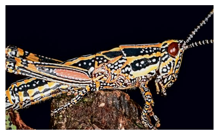
Fig. 2. Juvenile elegant grasshopper ( Z. elegans ).

In pyrrolizidine alkaloids<sup>[2,3]</sup> (Fig. 3), the nitrogen-heterocycle is bicyclic as exemplified by the alkaloids heliotrine and senecionine (Fig. 3), both of which are ingested by Z. elegans . It is not by accident that Z. elegans encounters plants containing these alkaloids. These insects can detect toxins up to several metres away. One study describes Z. elegans as 'eagerly' trying to reach host plants,