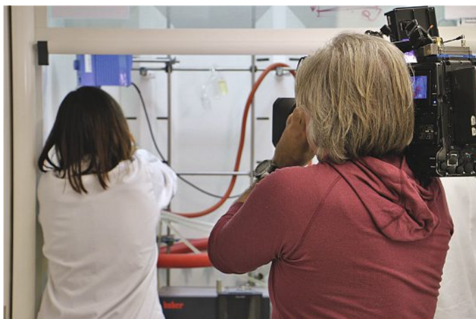
Fig. 4. The activities of the NCCR Bio-Inspired Materials have been highlighted through various media channels. Some of the NCCR's bio-inspired research was featured on the Swiss Italian public television (RSI).

society, from the general public to the industrial and public sectors. Some of the programs launched, like the research internships for undergraduate students, the postdoctoral fellowship for women in science, the childcare support or the proof-of-concept grant have already proven very successful, while the impact of other longer-term initiatives such as the new Master program or the equal opportunities envoys program will only be revealed through Phase 2 and beyond. Overall, the past achievements, ongoing projects, and future plans of the Center in the above discussed strategic areas are a solid standpoint from which our Center faces the challenges and opportunities of the following years.