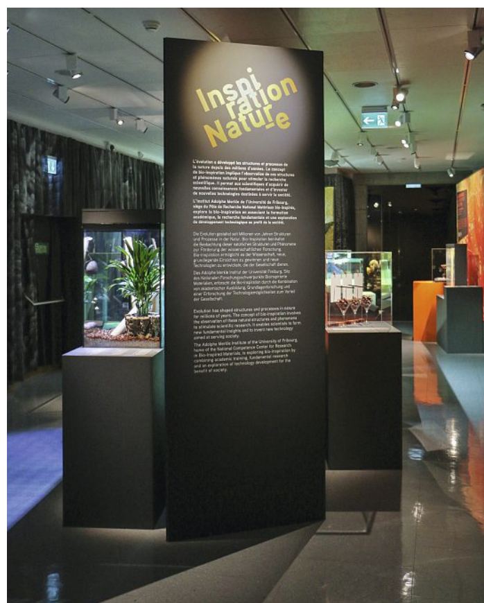
Fig. 3. The Fribourg Natural History Museum exhibition 'Inspiration Natur-e' was designed and curated with the NCCR Bio-Inspired Materials.

Looking to the next four years, the challenge will be to maintain momentum of the NCCR collaboration that has been successful in achieving scientific and innovation results. In addition to the events described above, new conferences including an international self-organized conference on bio-inspired materials will be held, workshops on career options, design thinking, innovation training and soft skills, new public outreach events including shipping of the natural history museum exhibit to the USA, and participation in expos and trade fairs. For technology transfer and innovation, a Proof-of-Concept grant program will continue with seed funds for technological development of research ideas, and a new course on innovation will be proposed.