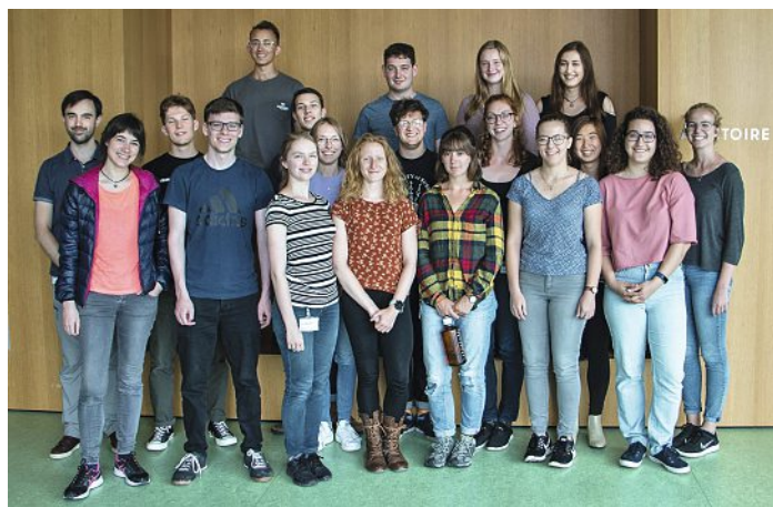
Fig. 1. The participants of the 2018 Undergraduate Research Internships came from universities in the United States of America, the United Kingdom, Spain and the Netherlands.

the Center, mentoring of PhD students and postdocs and grant writing support.