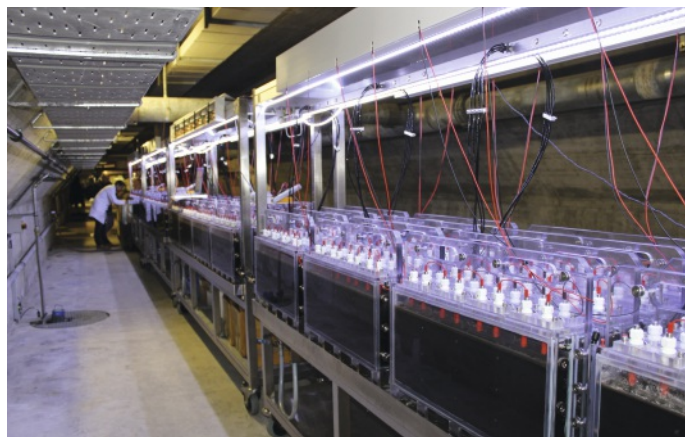
64-unit microbial fuel cell block for treating wastewater and generating electricity.

Microbial fuel cells also work with other waste. Using the fifty percent of food production that is thrown away would increase output per person from 10 to 60 Watts. In this case, and again omitting any power that the purification plant might consume, annual income rises to up to 10.5 million francs. All in all, large-scale microbial fuel cells represent a promising way of reducing the cost of operating wastewater treatment facilities.