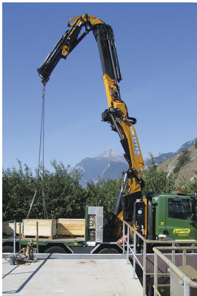
The microbial fuel cell arrives at the Châteauneuf wastewater treatment plant in Sion.