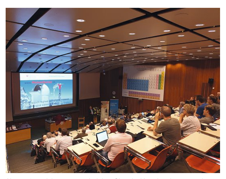
About 70 participants attended the «Chemical Landmark» symposium at the DCB of the University of Bern.

method based on Migeotte's spectral analysis. These substances destroy the ozone layer in the stratosphere.