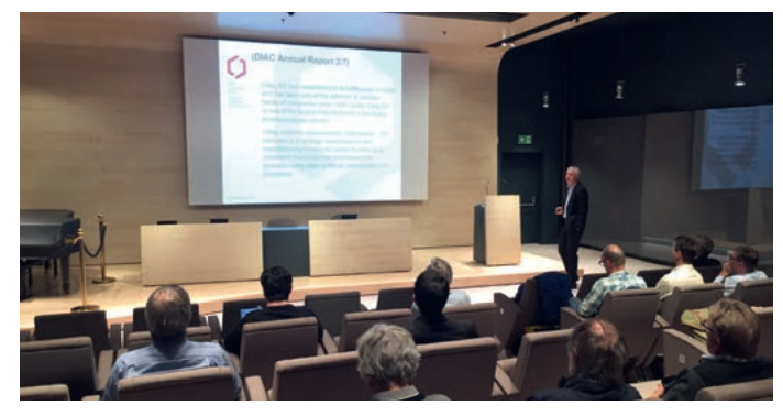
Fig. 3. DIAC's annual meeting held at Metalor Technologies SA in Marine Epagnier in 2019.

Sharing best practice and knowledge in the symposia lectures across the network will keep the interest high, (Fig. 3). This guarantees the sustainable existence of our industrial chemistry in Europe and thus of Switzerland and finally the DIAC.