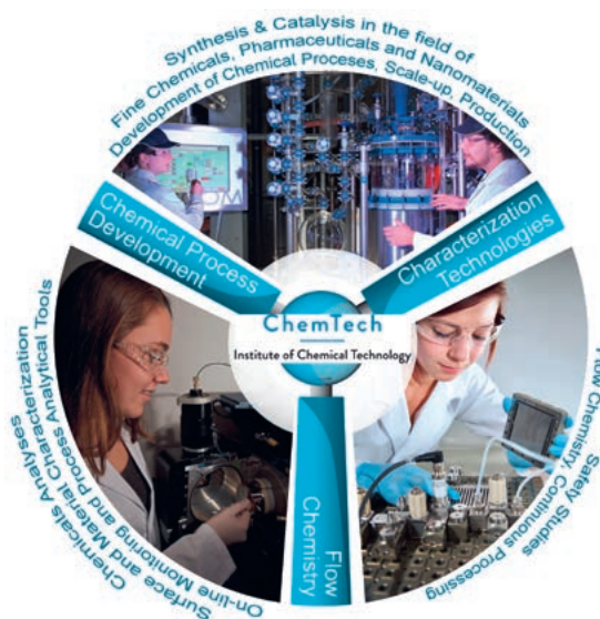
Main research focus areas of ChemTech