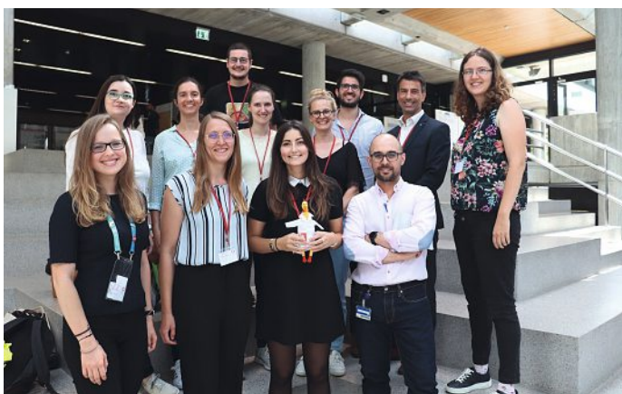
Fig. 1. Members of youngSCS at the SCS Fall Meeting 2022.

On September 8 th 2022, the General Assembly of the youngSCS was held at the Irchel Campus of the University of Zurich during the SCS Fall Meeting (Fig. 1). It allowed us to present the association to young researchers attending the conference, to reflect on past events and highlight our upcoming events. These are usually articulated around three topics: Science Communication, Academia, and Industry.