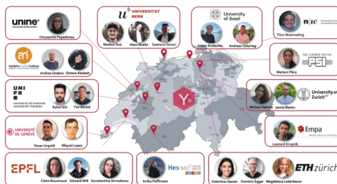
Fig. 5. Representatives of the youngSCS in 2022–2023.

The youngSCS also has local representatives in the following Swiss institutions: Adolphe Merkle Institute (AMI), EPFL, EMPA, ETHZ, HES-SO, Paul Scherrer Institut (PSI), University of Basel, University of Bern, University of Fribourg, University of Geneva, University of Applied Science Northwestern Switzerland, University of Neuchâtel and University of Zurich (Fig. 5).