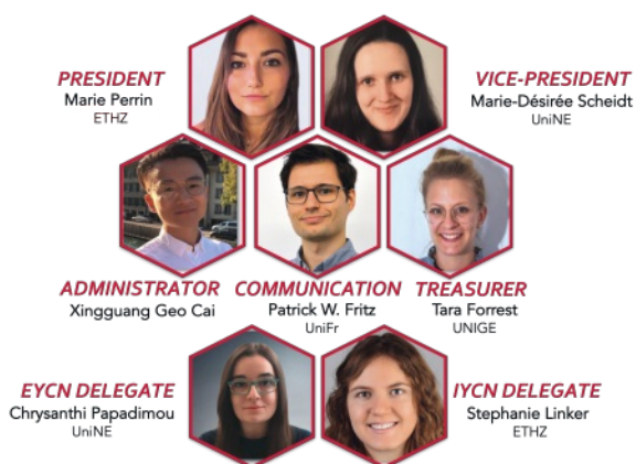
Fig. 4. Board of the youngSCS in 2022–2023.