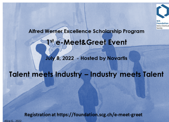
Figure 1: Announcement of the e-Meet & Greet event. Graphics by Alice Gallou.

1 Novartis Pharma AG, Chemical Development, 4002, Basel, E-mail: fabrice.gallou@novartis.com ; 2 SCS Foundation, c/o Swiss Chemical Society, Laupenstrasse 7, 3008 Bern, E-mail: luethi@scg.ch ;