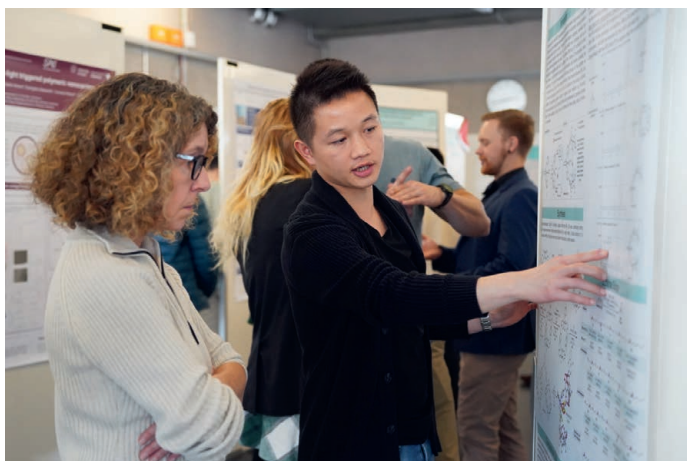
Fig. 2. Impressions from the poster session.