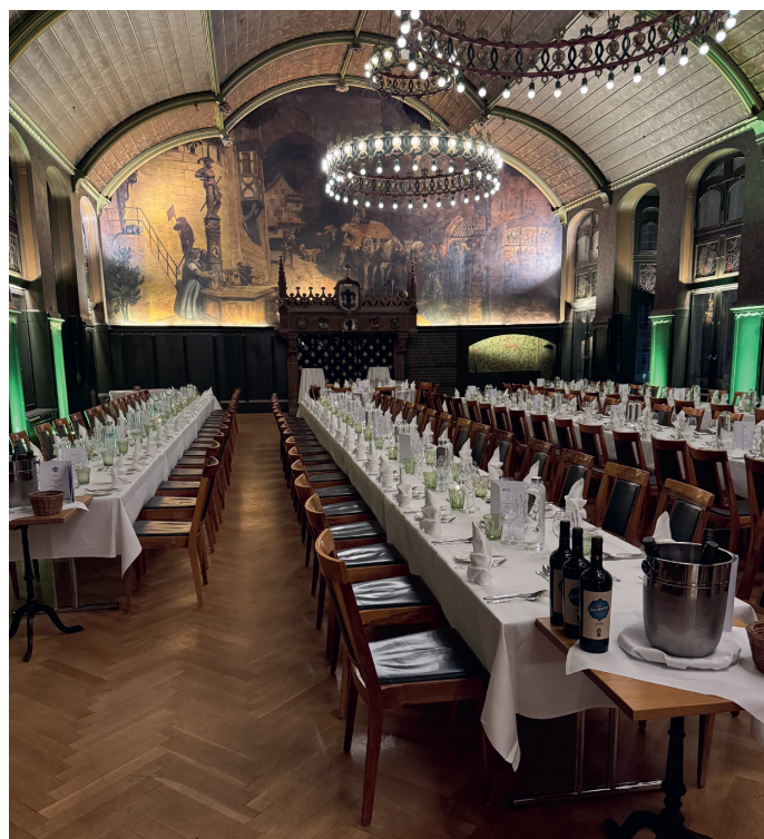
Fig. 3. Symposium Banquet Venue.

The symposium banquet took place on the Thursday evening at the restaurant Safran Zunft in the city center of Basel (Fig. 3). The magical and antique atmosphere of the historical dining hall allowed all the attendees to connect, share impressions and enjoy