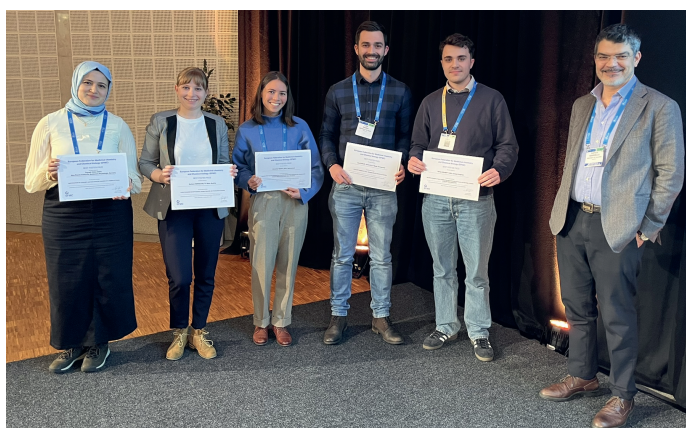
Fig. 4. Poster prize awards.