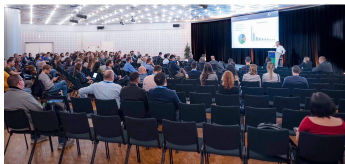
Fig. 1. Opening Ceremony of the EFMC-ISCB 2025 Conference.

The 2 nd edition of the EFMC International Symposium in Chemical Biology (EFMC-ISCB) took place in Basel, Switzerland, from the 29 th to the 31 st of January 2025, jointly organized by the Division of Medicinal Chemistry and Chemical Biology (DMCCB) of the Swiss Chemical Society (SCS) and the European Federation for Medicinal chemistry and Chemical biology (EFMC). The conference featured over 250 speakers and attendees from multiple countries across Europe, the United States, and India. The program was filled with insightful talks, divided into seven sessions with three plenary lectures. After the opening ceremony by Dr. Uwe Grether (F. Hoffmann-La Roche, CH) and Dr. Luc van Hijfte (Symeres, NL), the EFMC-WuXi AppTec Award for Excellence in Chemical Biology ceremony followed, chaired by Dr. Luc van Hijfte (Symeres, NL) and Dr. Dave Madge (WuXi AppTec, UK) (Fig. 1). The 2025 awardee, Prof. Peng Chen (Peking University, CN) (Fig. 2) started the morning with his plenary lecture titled: ‘ Deciphering Spatial-Temporal Biology with Bioorthogonal Cleavage Reactions ’. He described the use of bond-cleavage reactions in living systems, in the context of the exploration of a spatio-temporal organization of the proteome and interactome.